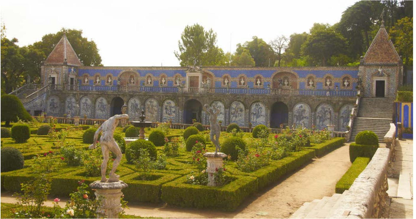
Jardim Grande at Fronteira

only individuals, but also states and politics generally. Though these were irresistible forces, Machiavelli believed that human temperament also had a role in forming the character of regimes, and that the military and political actions of individuals could change the course of history. To achieve this, these individuals had to possess the right qualities of virtù and recognise the moment in which Fortuna gave them an opportunity. This is what concerns the fourth side of the garden.