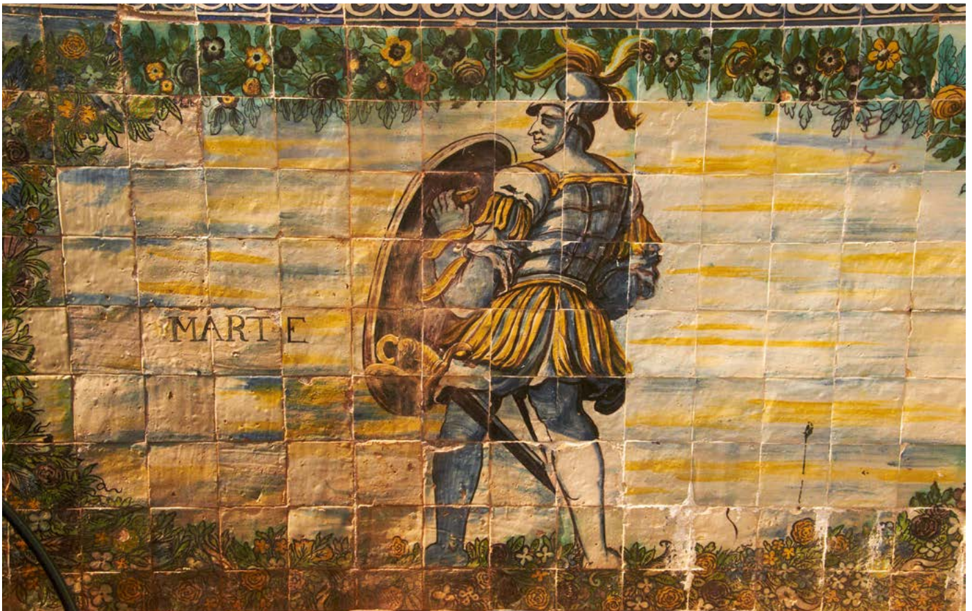
Mars, Tiles , Fronteira Gardens

During the Renaissance the natural motions of the heavens, planets and stars were believed to affect not