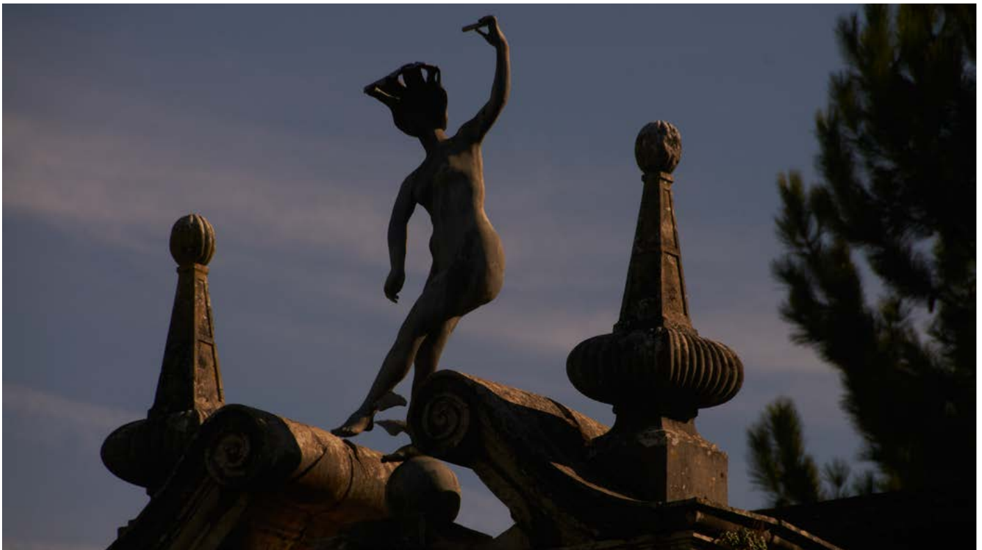
Fortuna, Lead Statue, Fronteira Gardens