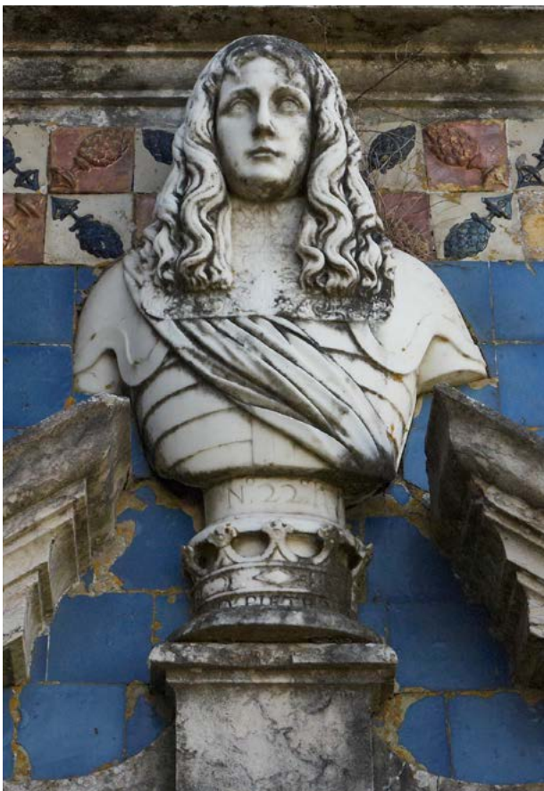
Regent D. Pedro II, bust

The Jardim Grande is closed by an elaborate structure known as the Gallery of the Kings, which is built around and above a decorative lake. It is here that the statue of Fortuna stands at the highest point of the structure on the central axis of the garden. According to our Machiavellian reading, the purpose here is to illustrate that part of life – both of individuals and of state – to which Fortuna grants an opportunity for greatness: the other half of destiny .