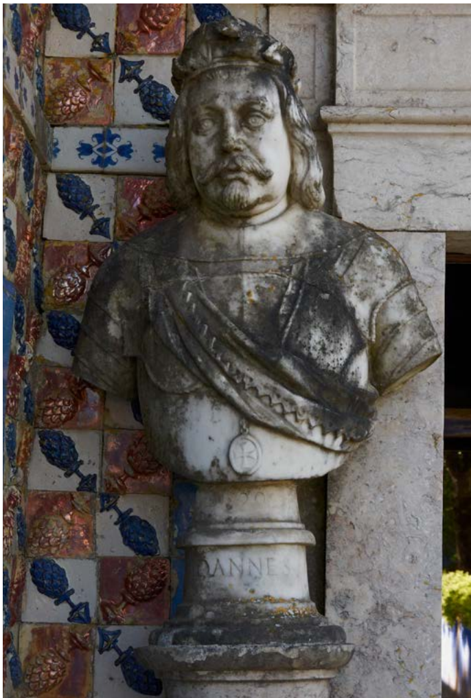
King D. João IV, bust