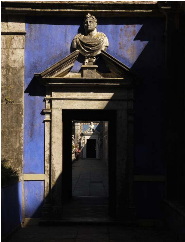
Emperor Tiberius, bust

1969: 165; De Melo 1650). Whilst he was still Regent, Dom Pedro was compared directly with Tiberius for his refusal to adopt the title of King (Lacerda 1669: 264). But Dom Pedro changed with the times, just as Machiavelli recommended. By force of his own virtú , as opposed to the complete lack of these qualities in his brother the king, Dom Afonso VI was removed as an obstacle to his own kingship. Dom Pedro, with no assistance from Fortuna , created his own opportunity: